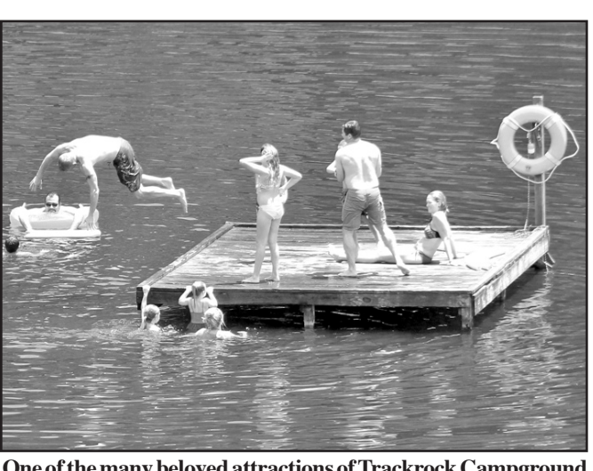
One of the many beloved attractions of Trackrock Campground & Cabins is the lake, with its warm beach and centralized swimming dock. Kids love to jump off and be thrown from the dock in hot summer weather.